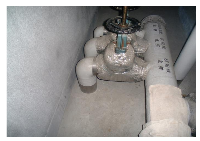
On outlet pipe of elevated water tank for the research building